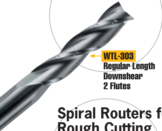
WTL-303 Regular Length Downshear 2 Flutes