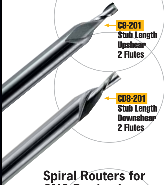
C8-201 Stub Length Upshear 2 Flutes